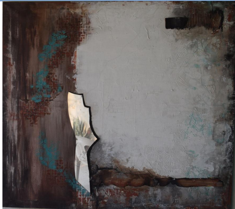
Plate 5: Tranquility , 3 feet by 3 feet, mix media collage on canvas