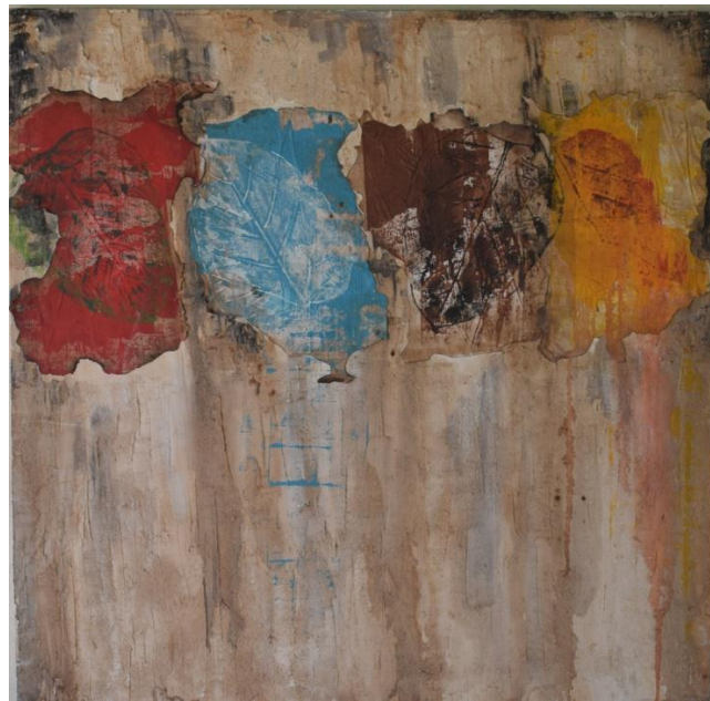
Plate 2: Phenomena of Time , 3 feet by 3 feet, Mix media , collage on canvas.

First one is natural world where we live with other living and non living organisms,