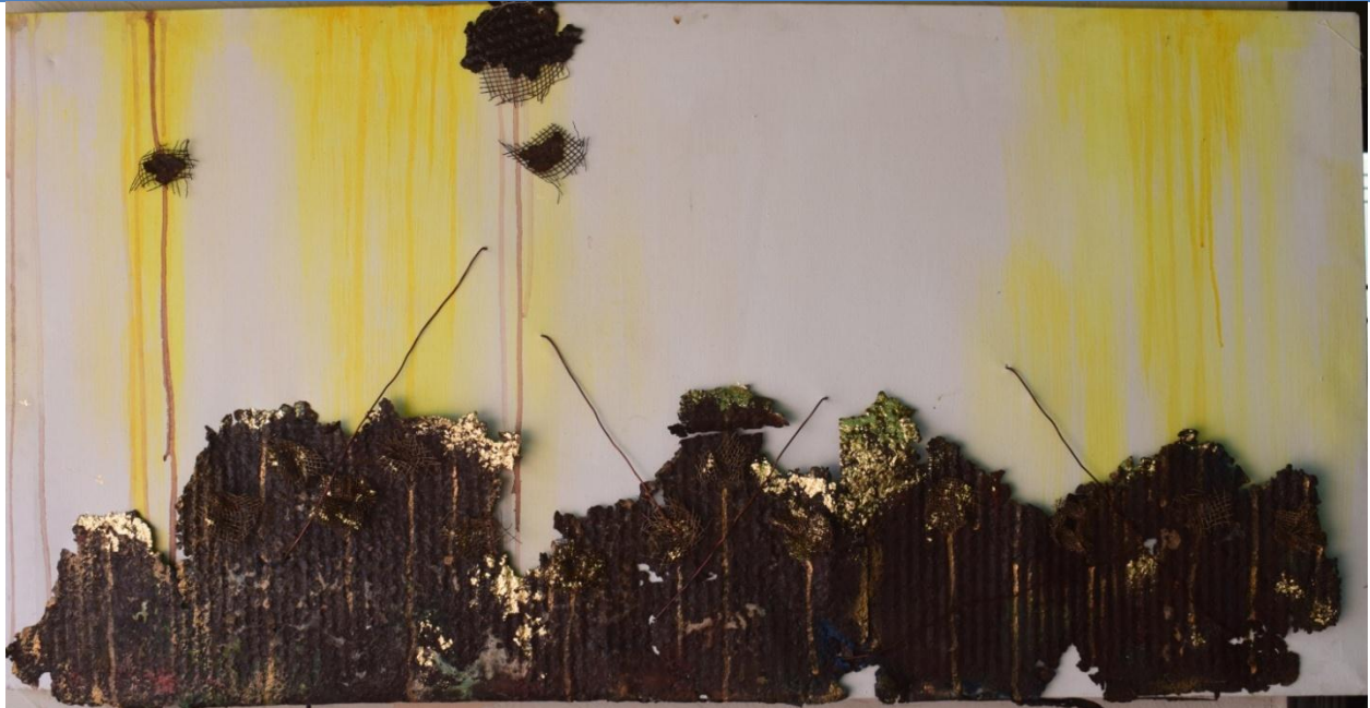
Plate 4: Tazkia e Nafs 6 , 2 feet by 4 feet, acrylic paint and collage of rustic iron