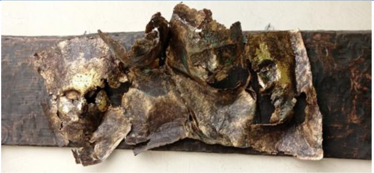
Plate 3 : Thy Yourself , 1.5 feet by 4 feet, sculpted metal and wood