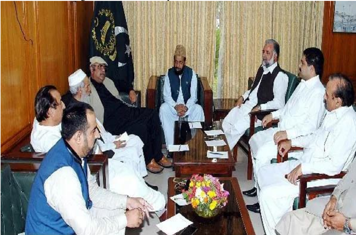
Figure 4: Hazara parliamentarians meet political leadership for the evolving consensus of Hazara province.

provinces needed the hour. 24 Figure 4 shows the Hazara parliamentarians meeting with political leaders for the evolving consensus of Hazara province. 25