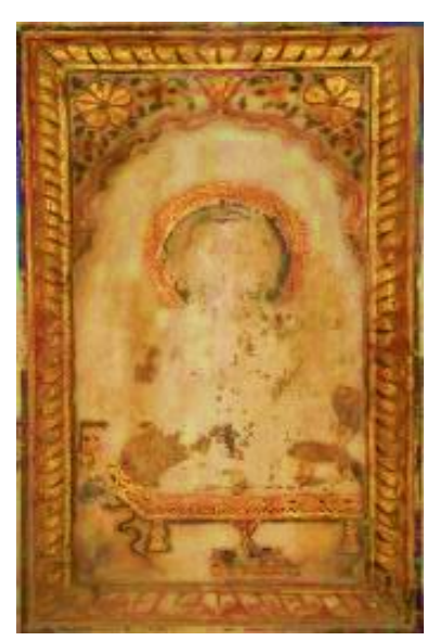
Figure 13: Unidentified Thirthankara