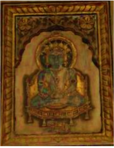
Figure 8: Depiction of Vasupujya

Below the former square panel, the 12<sup>th</sup> Tirthankara, Vasupujya is depicted inside a rectangular panel. The rectangular frame is ornamented with lotus petals of golden color. The Tirthankara is shown seated on a throne, under a multifold arch niche. Spandrels of the arch are decorated with five petaled golden flowers while a three petaled flower is depicted at the level of key stone. Rest of the area is covered with leaves. The seated Tirthankara wears a head dress. He is richly ornamented with jewelry including ear rings, necklaces, armlets and bangles. A buffalo, his ride, is sitting under his throne.