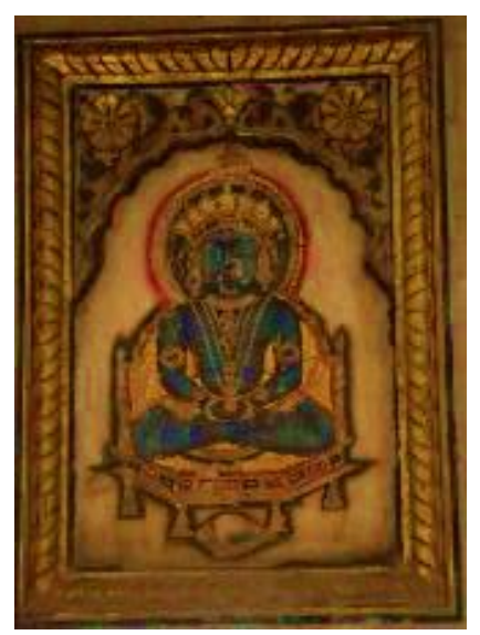
Figure 11: Depiction of Neminatha