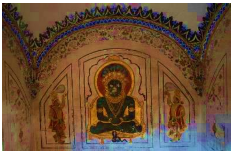
Figure 3: Depiction of Lord Parshvanatha in Small Chamber

seated under the canopy of nine heads of cobra snake. His prominent throne and radiating halo behind his head are also permanent features of the figural representation. Among the body ornaments include ear rings, necklace, armlets and bracelets. A snake is depicted under his throne and according to Jain mythology snake is his ride. All features are painted with black, golden and red color.