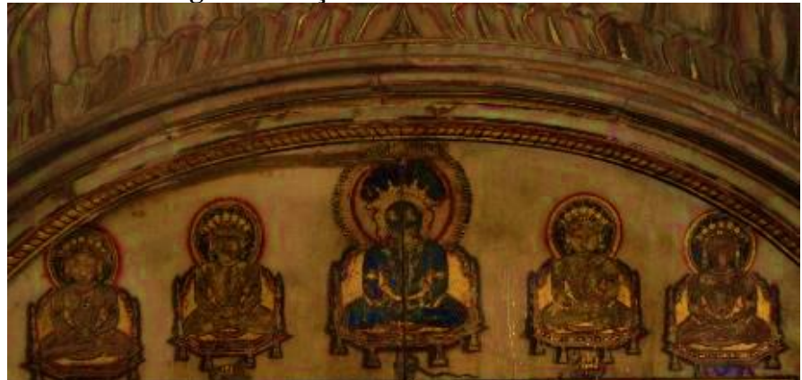
Figure 2: Depiction of the Five Tirthankara above the Main Chamber