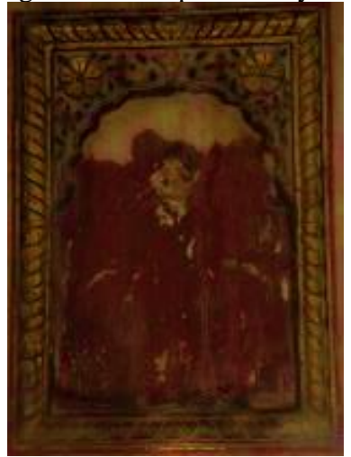
Figure 12: Unidentified Figure

Third panel might be same as the right side third panel. Only a face with shaved head is seen in it.