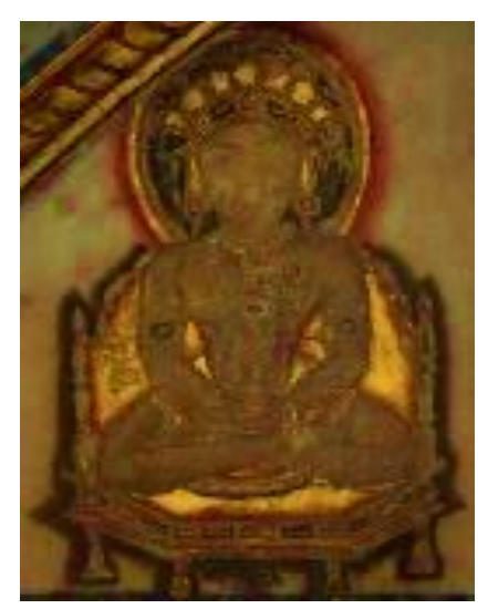
Figure 4: Depiction of Pushpadanata