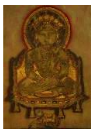
Figure 6: Depiction of Rishabnatha