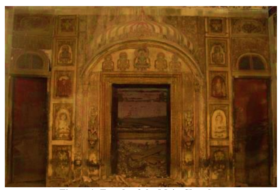
Figure 1: Façade of the Main Chamber