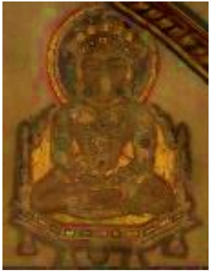
Figure 7: Depiction of Chnadraprabha

In extreme right corner of the painting and also of the main deity another Tirthankara is depicted, that is Chandraprabha , the 8<sup>th</sup> Tirthankara. His style of depiction is identical to rest of the Tirthankaras of the painting. He is haloed and seated cross legged on a thorn, wears throne over his head. Same as others also wears necklace, ear rings, armlets and bracelets. A crescent is depicted under his throne that is his ride.